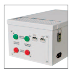
EBEL:VENT-EN-U Recirculated air attachment Technical specifications see page: 16